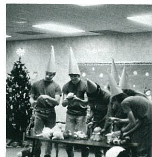
"Which one of you has been naughty or nice."