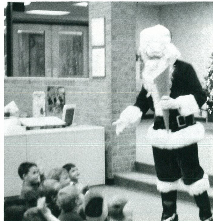
Santa's elves are through doing their job until next year.